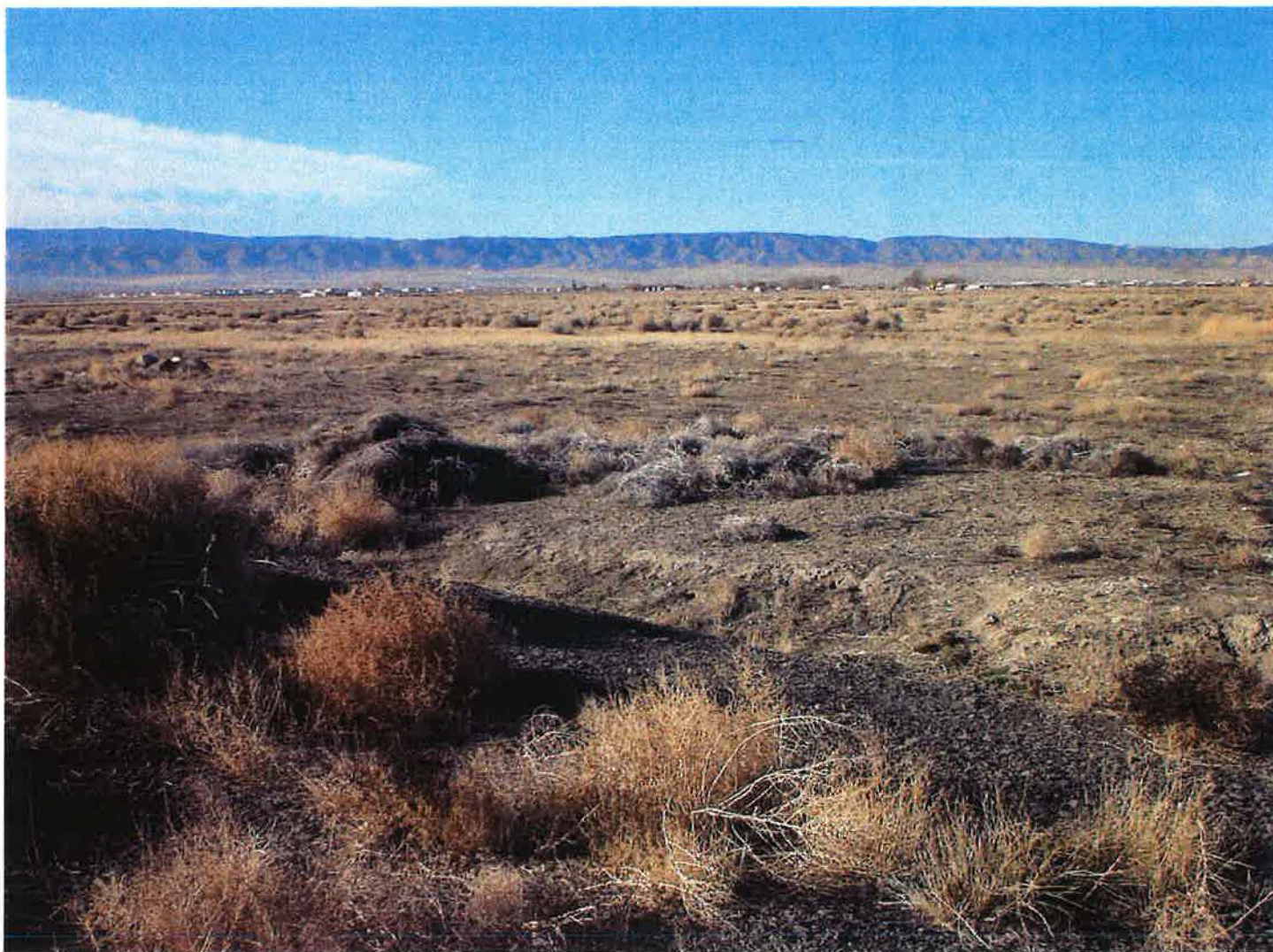
View southwest from northeast property corner