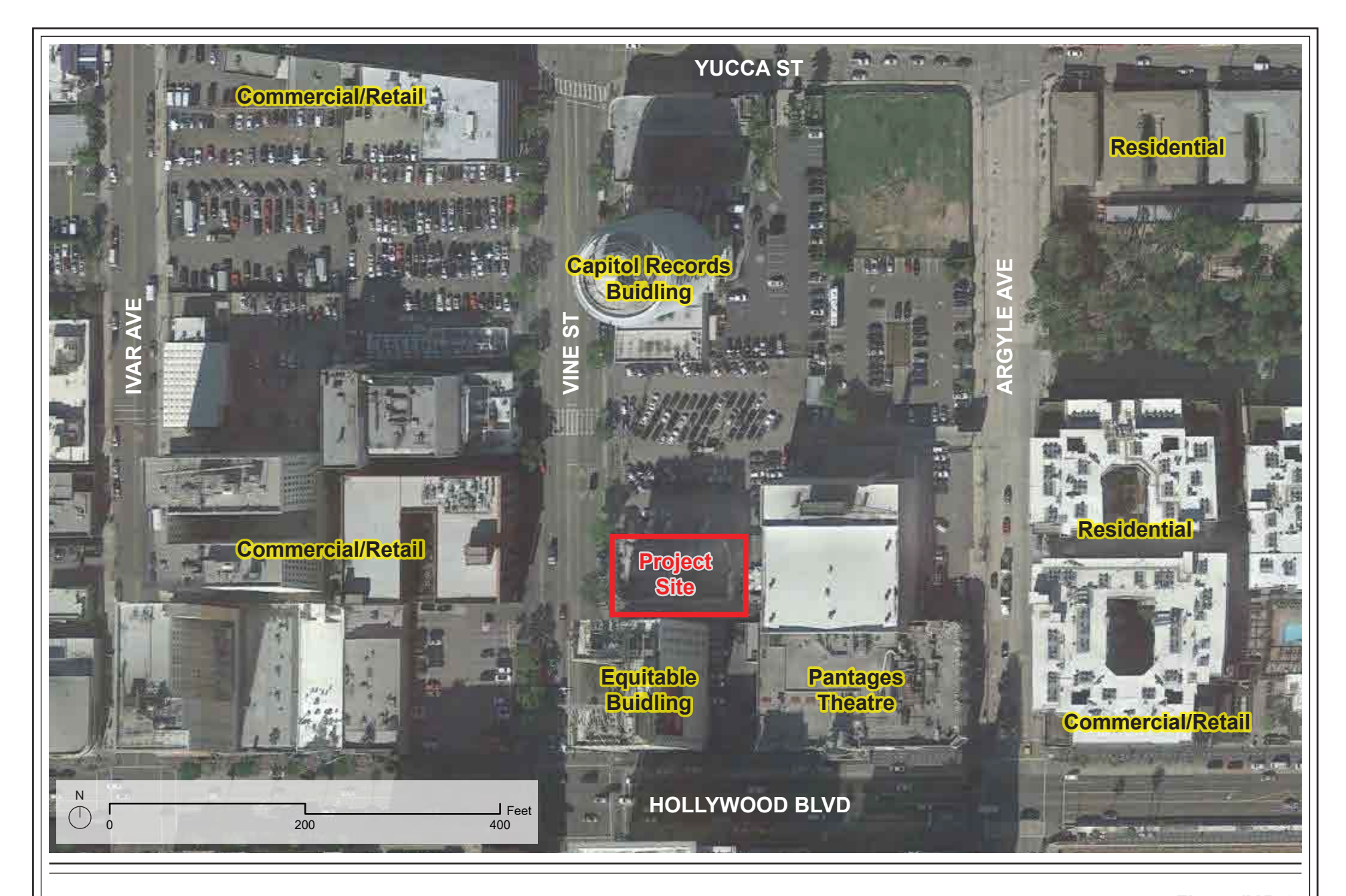
Figure IV.B-3 Air Quality Sensitive Receptors Locations