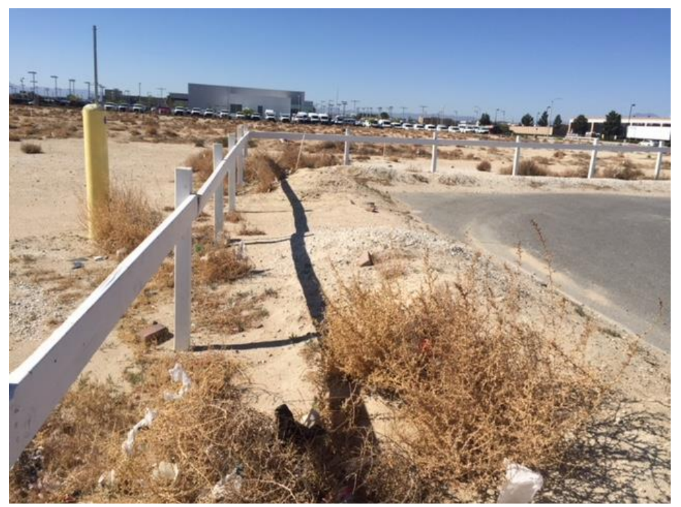
Photograph 6. Western perimeter of project, facing south.