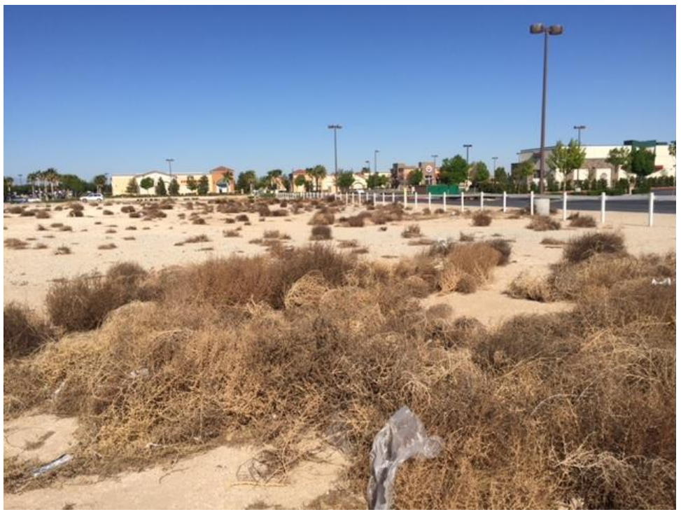
Photograph 3. Northeast corner of project site, facing west.