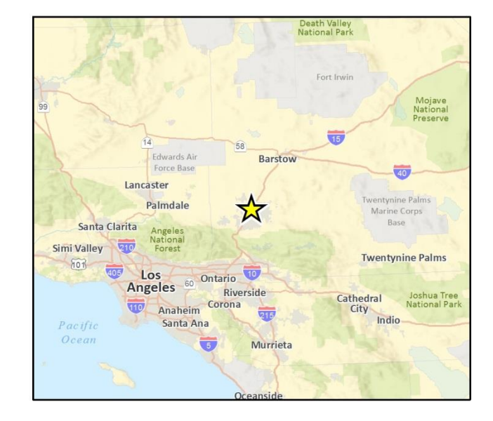
Fig 1 Regional Locati