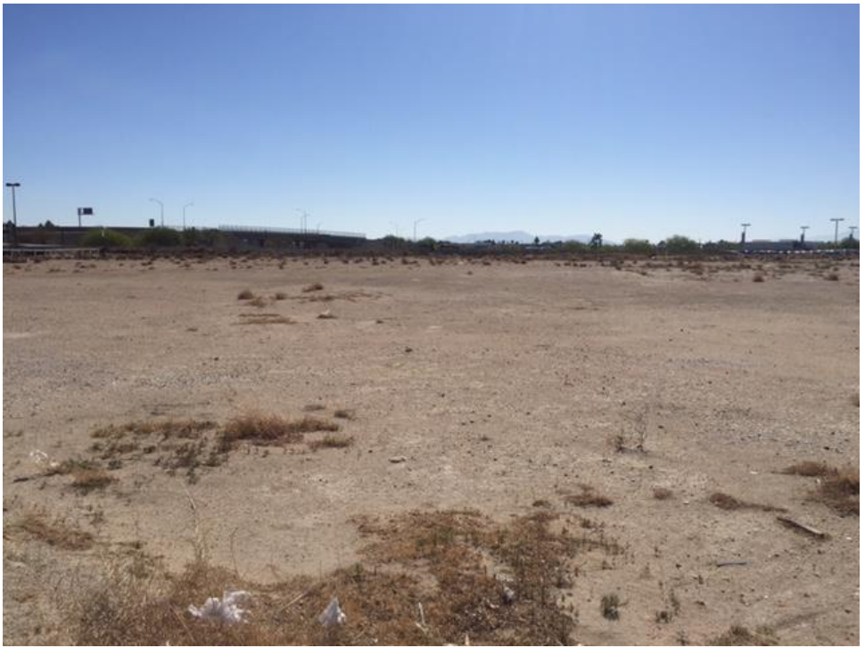
Photograph 5. Middle of project site, facing east.