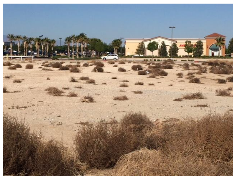
Photograph 2. Eastern perimeter of project site, facing west.