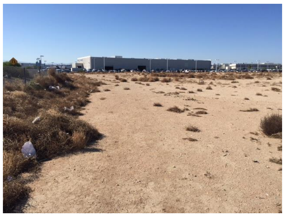
Photograph 4. Northeast corner (eastern perimeter) of project site, facing south.