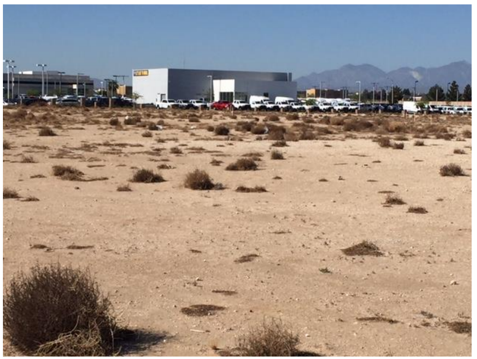
Photograph 1. Northeast corner of project site, facing south.