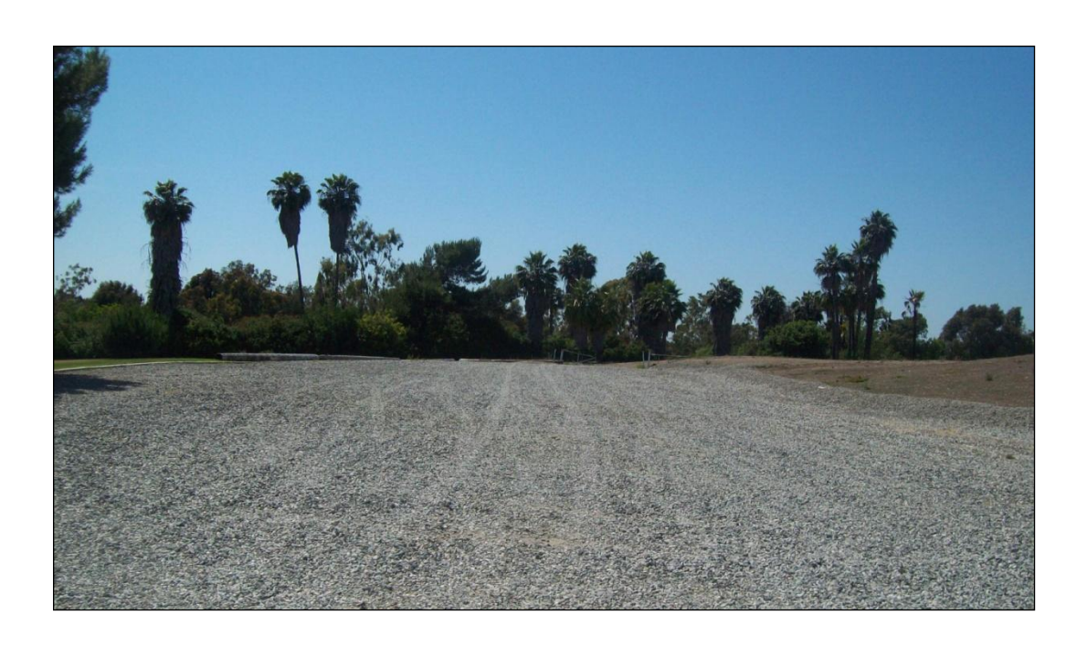
View of gravel parking area in the southern portion of the park, facing west.