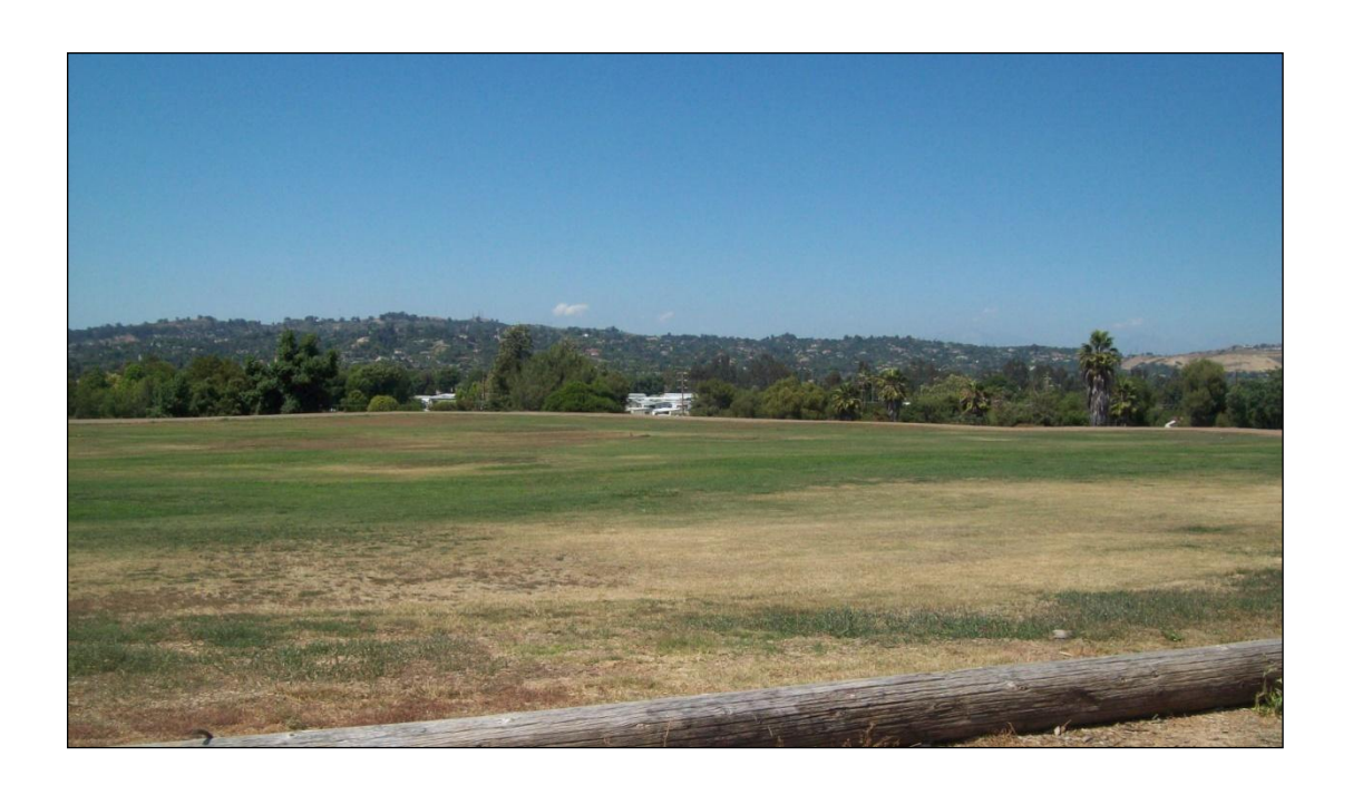
View of turf area in the center of the park, facing northeast.