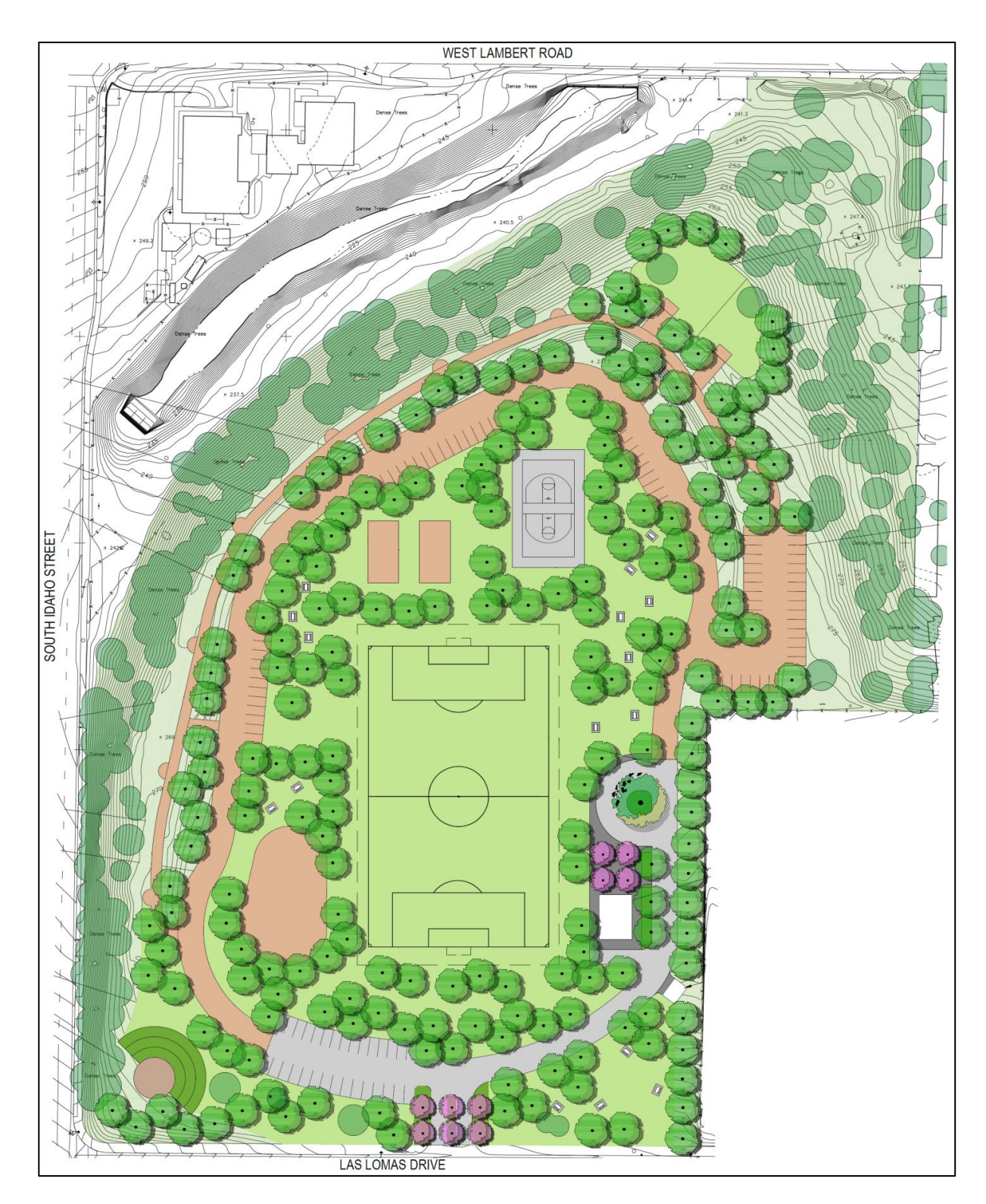
EXHIBIT 2-7 CONCEPTUAL SITE PLAN (ALTERNATIVE A)