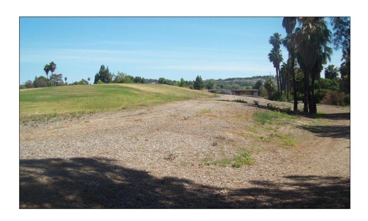
View of turf area in the center of the park, facing northeast.