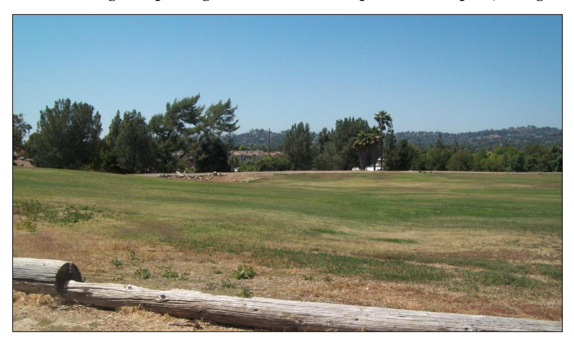
View of turf area in the center of the park, facing northwest.