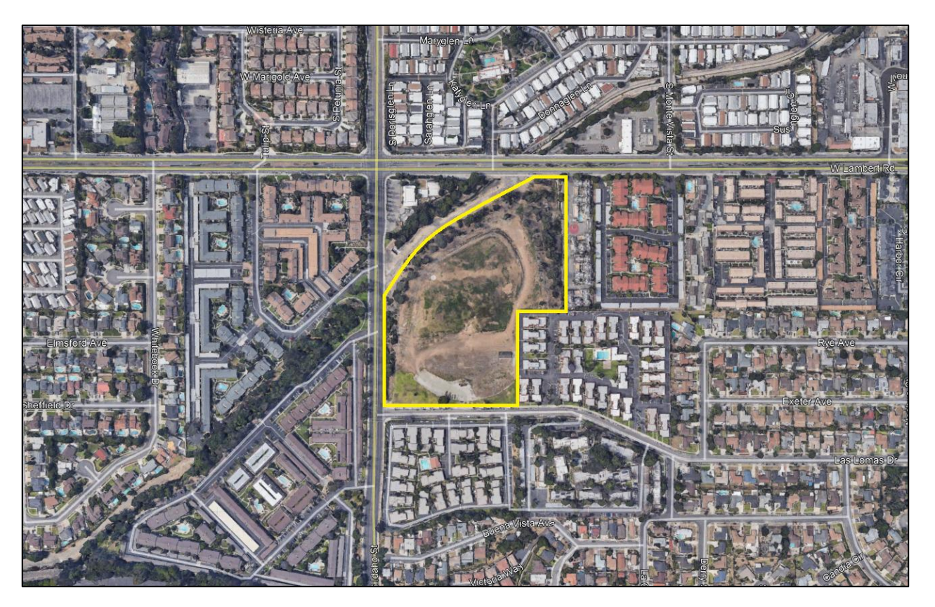
EXHIBIT 2-4 AERIAL MAP