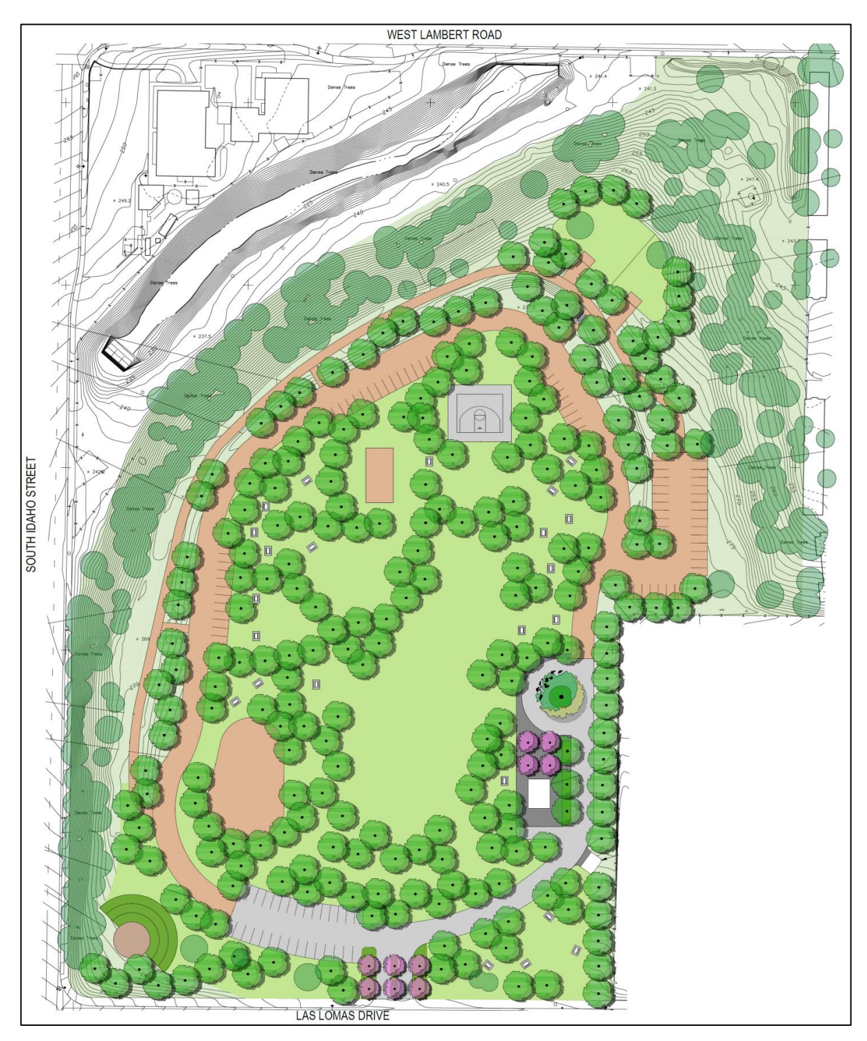
EXHIBIT 2-8 CONCEPTUAL SITE PLAN (ALTERNATIVE B)