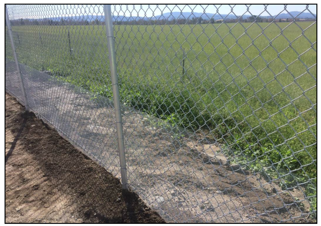
Photo 4: Recently installed small mammal exclusion fence attached to the chain link boundary fence on February 6, 2019.