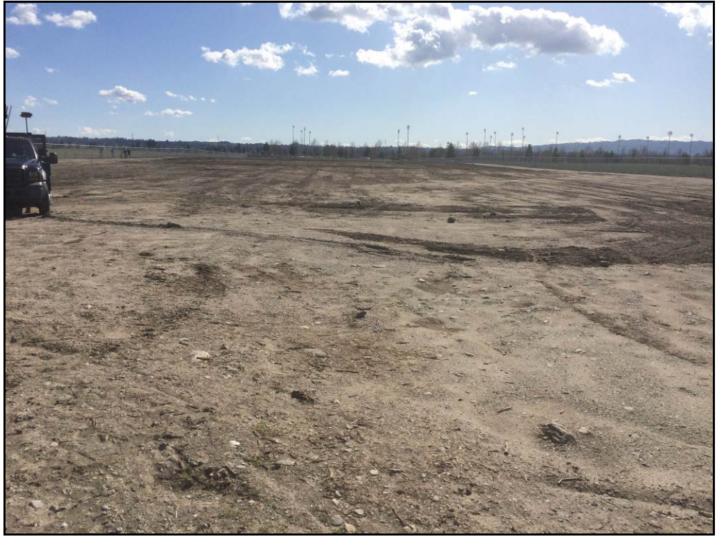
Photo 1: North end of the project site looking south on February 6, 2019.

BCR Investments, Inc. March 29, 2019 Page 11 of 14