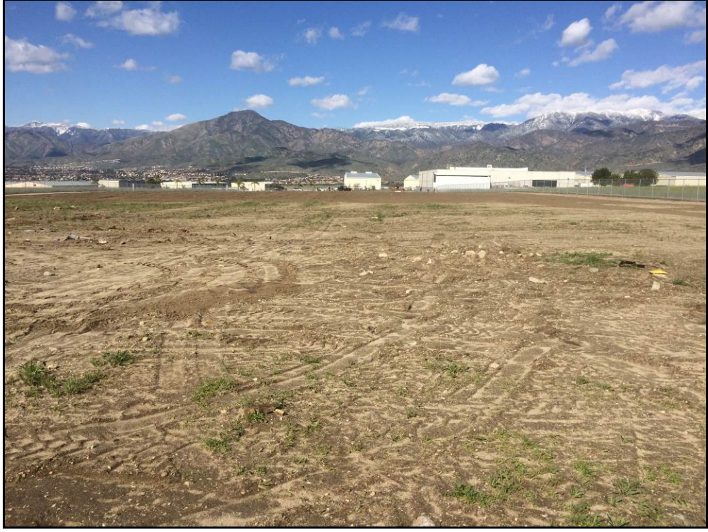
Photo 3: South end of the project site looking north on February 6, 2019.

BCR Investments, Inc. March 29, 2019 Page 12 of 14