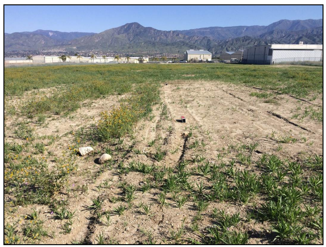
Photo 6: One of the middle trap lines looking north on March 25, 2019.