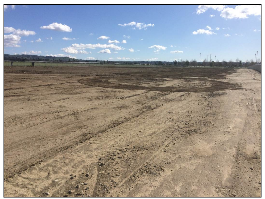
Photo 2: Middle of project site looking south on February 6, 2019.