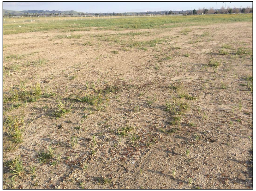
Photo 8: Representative picture of the soil and vegetation on site on March 25, 2019.