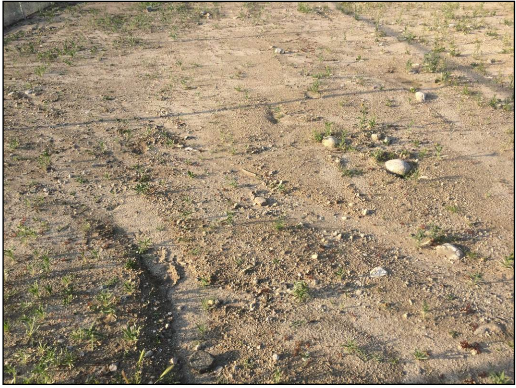
Photo 7: Representative picture of the soil on site on March 25, 2019.

BCR Investments, Inc. March 29, 2019 Page 14 of 14