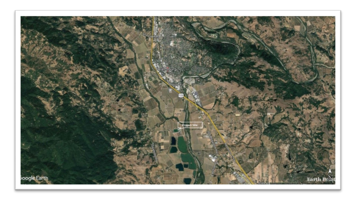
Figure ES-1 Healdsburg Water Reclamation Facility Site Location

The Project site is located within a 36-acre water reclamation facility site that is situated between Foreman Lane to the north and Cohn Road to the south (Figure ES-1). The proposed technology type for the solar project is floating arrays, whereby the panels would be mounted to pontoons that are anchored to ballasts located outside the ponds. As shown on Figure ES-2, the site would accommodate three arrays totaling 8.13 acres. The total installed capacity would be approximately 3.62 \, \text{MW}_{dc} .