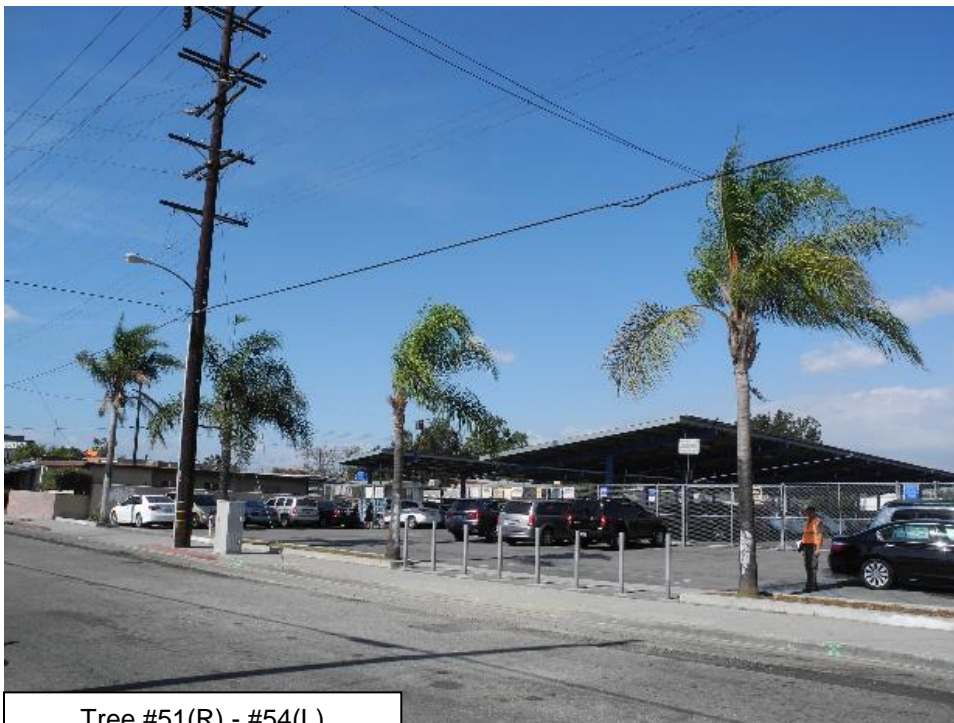
Tree #51(R) - #54(L)