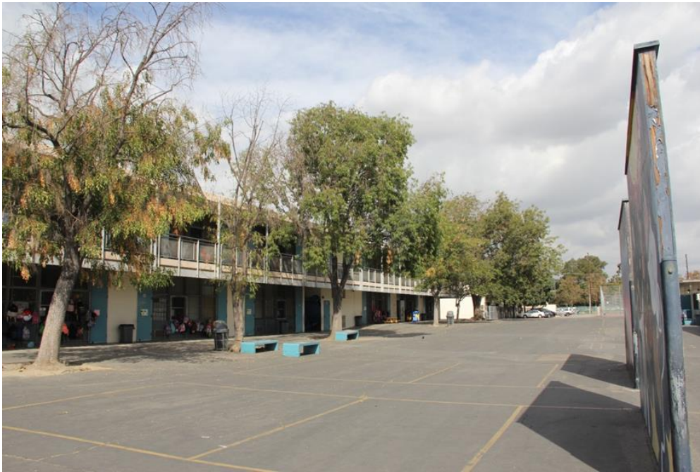
Mature Tree Canopy Within Campus Core