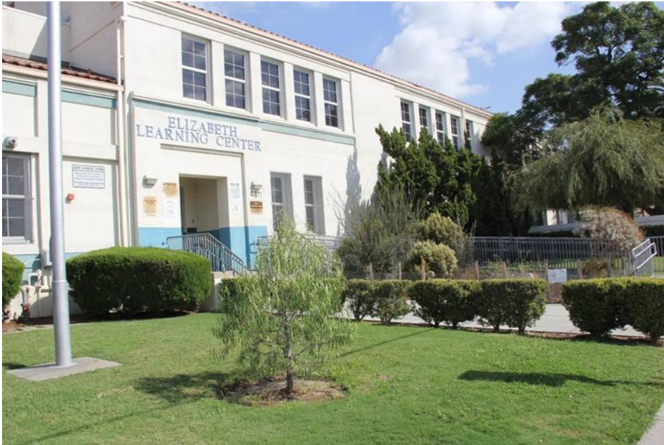
School Entrance Planting

The following photos are a representation of the unique features and conditions on the campus. A full listing of photographs is included in Section 11.1.