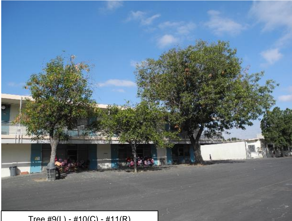
Tree #9(L) - #10(C) - #11(R)