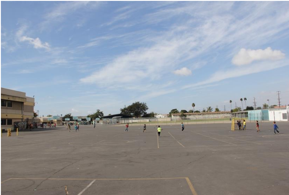
Campus Interior Lacks Shade; Pavement Cracking