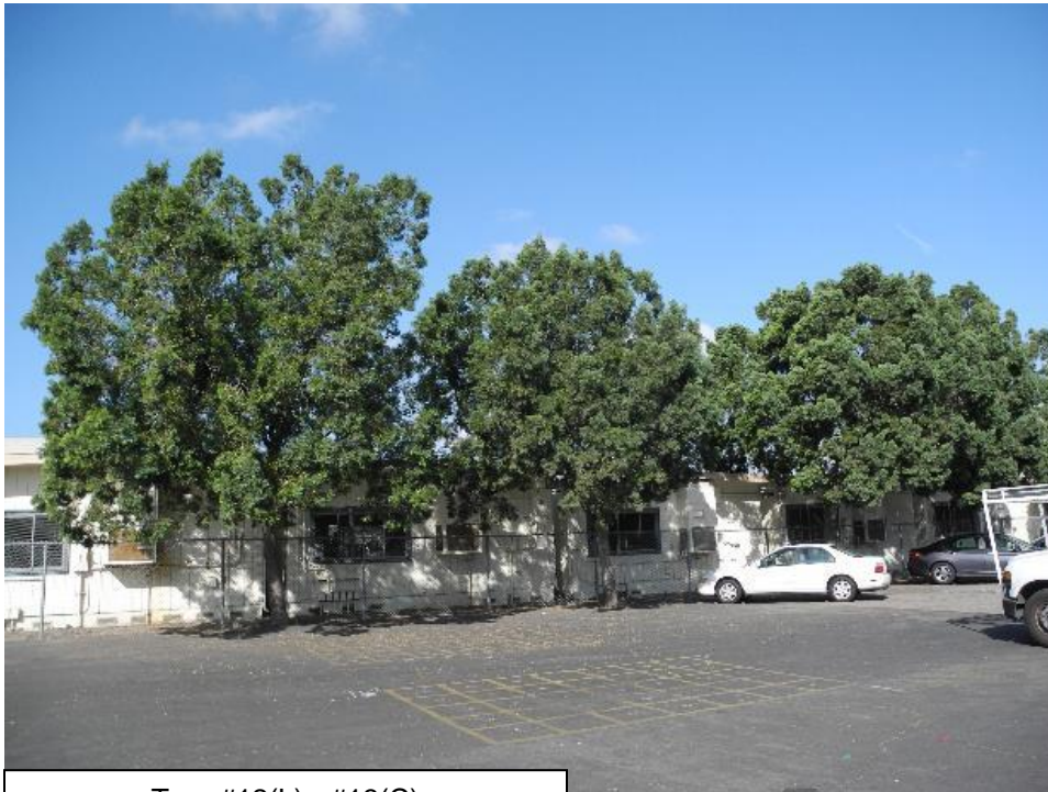
Tree #12(L) - #13(C)