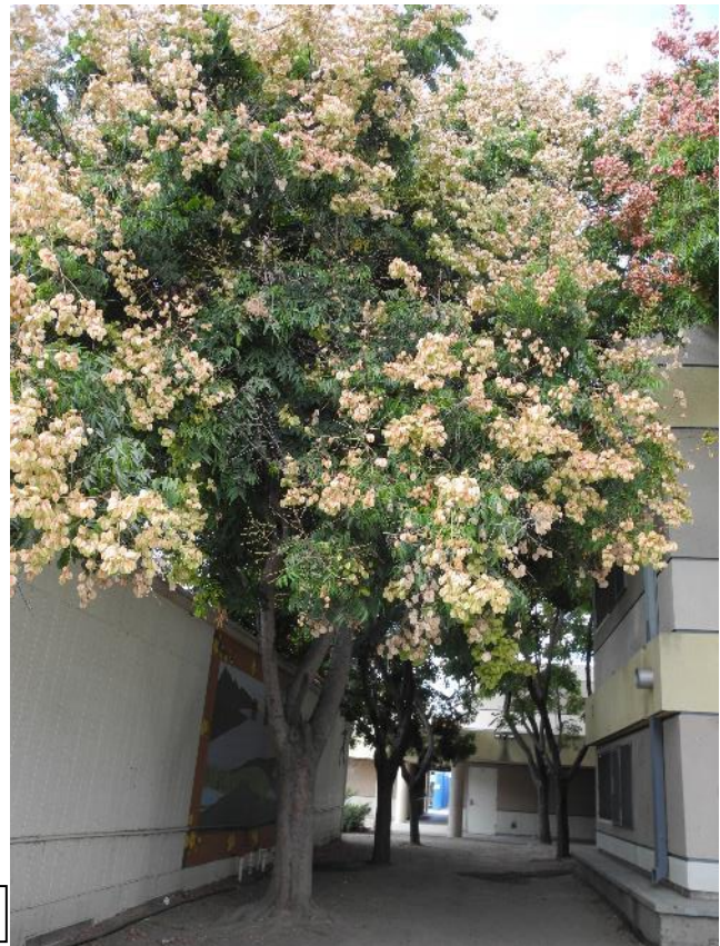
Tree #35(R) - #39(L)