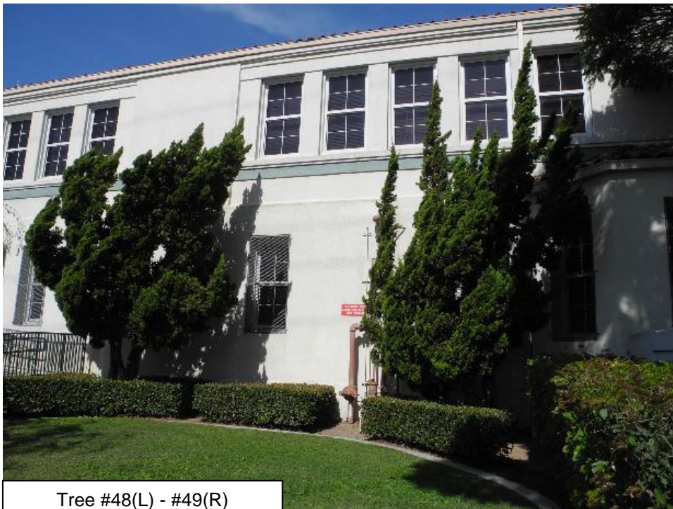
Tree #48(L) - #49(R)