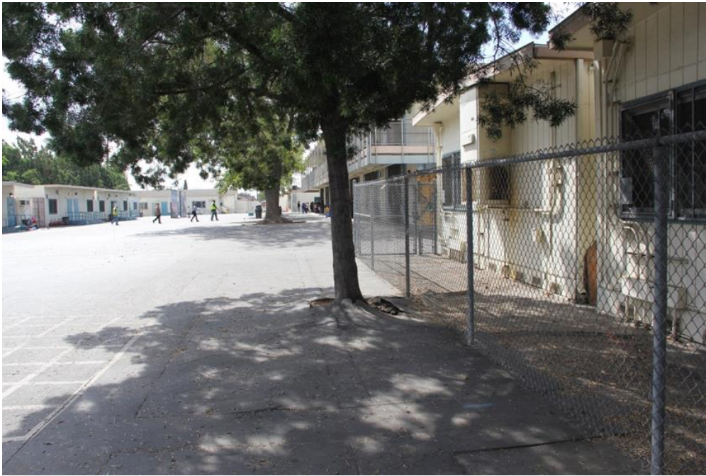
Cracked and Lifted Asphalt Paving