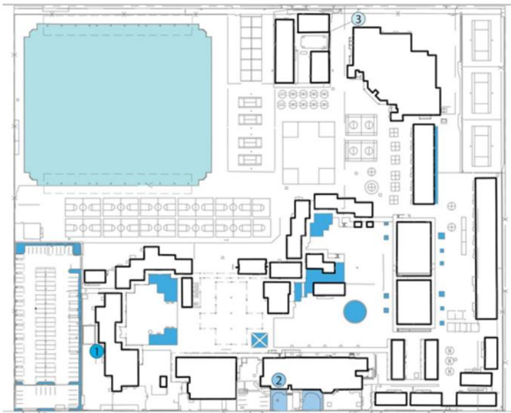
Irrigation Zoning and Point of Connections