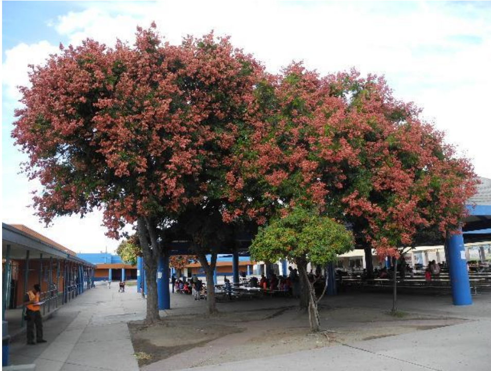
Tree #32(L) - #34(R)