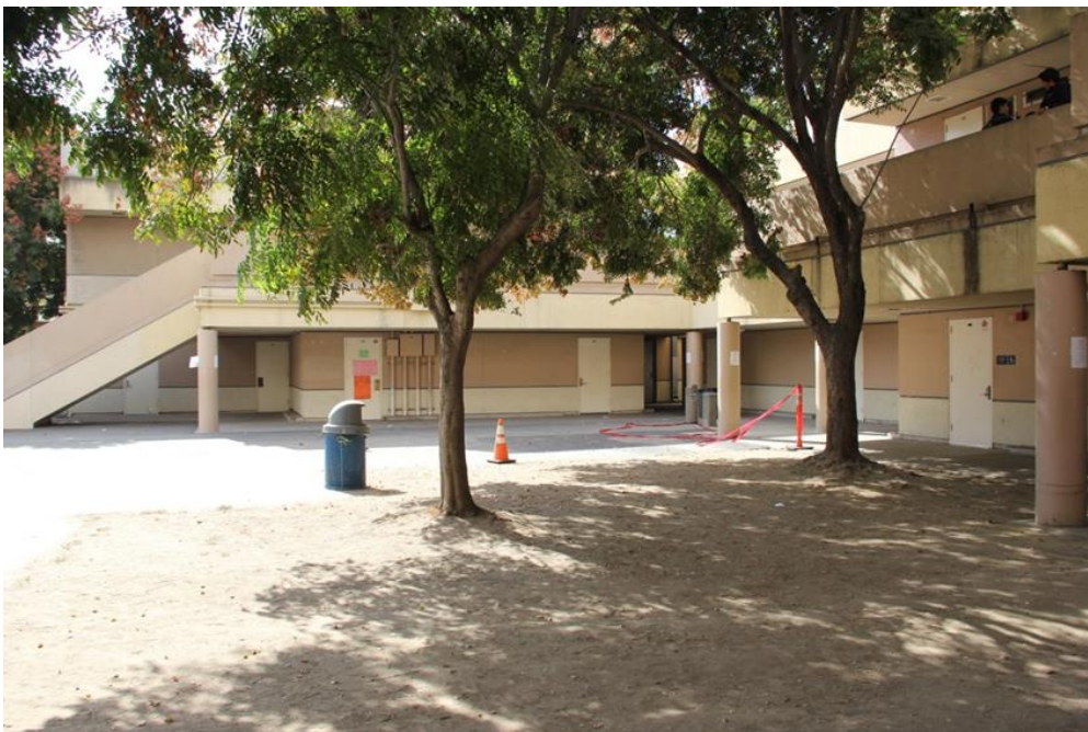
Planting Area Void of Mid-Level Shrub Material