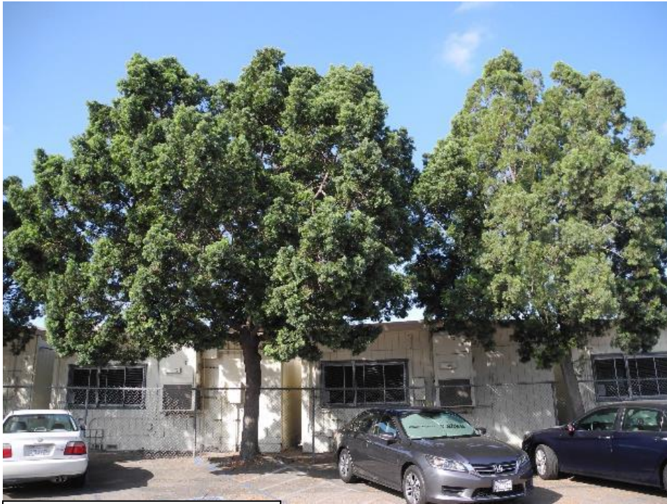
Tree #14(L) - #15(R)