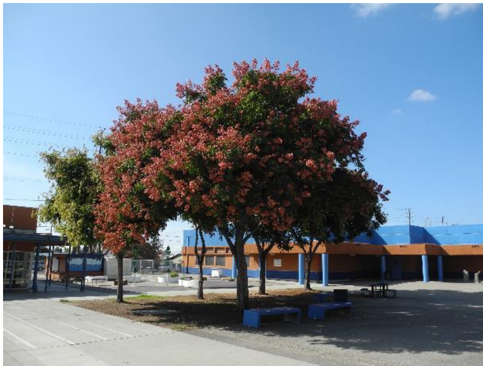
Tree #27(R) - #31(C)