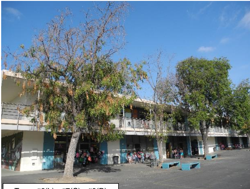
Trees #6(L) - #7(C) - #8(R)