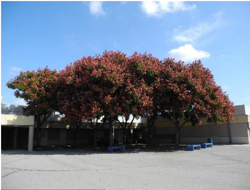
Tree #20(L) - #26(R)