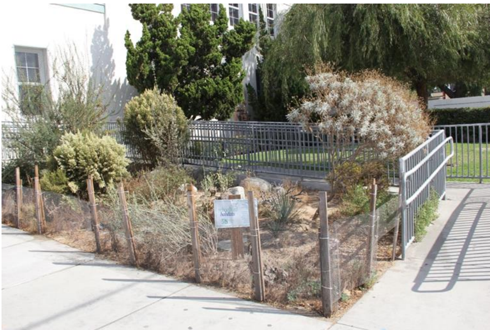
California Native Habitat Garden