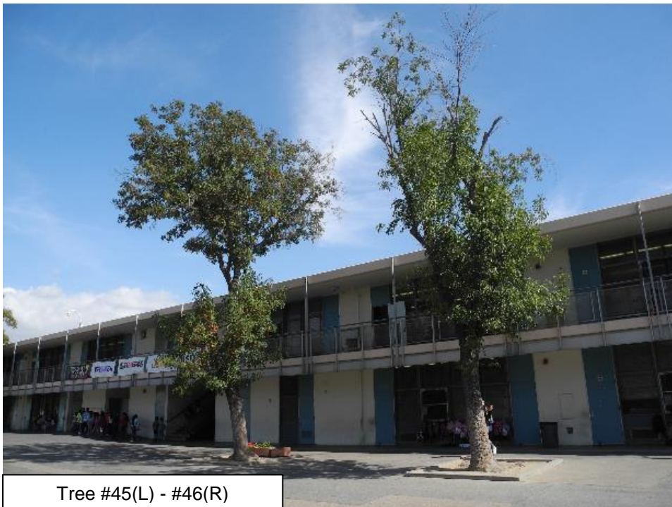
Tree #45(L) - #46(R)