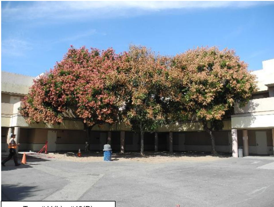
Tree #41(L) - #43(R)