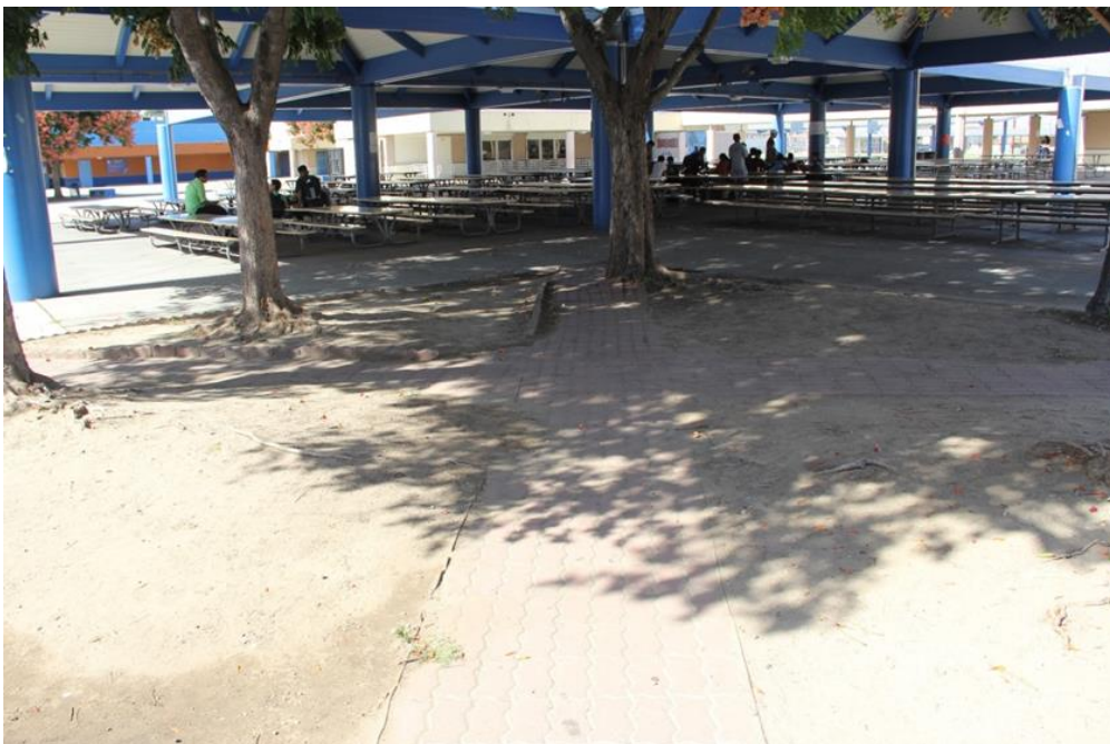
Trees Causing Uplift On Brick Pavers