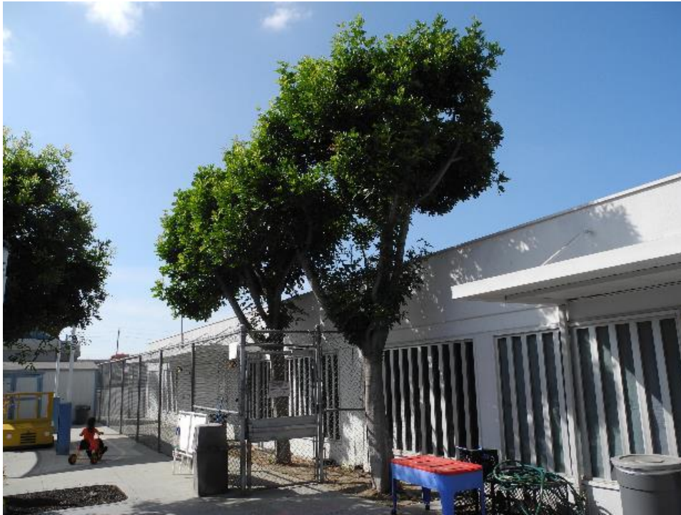
Tree #17(R) - #18(L)