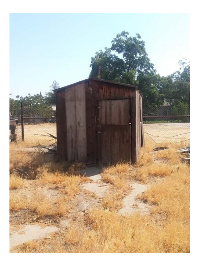
Figure 2 P-1, Building 1, View toward the East