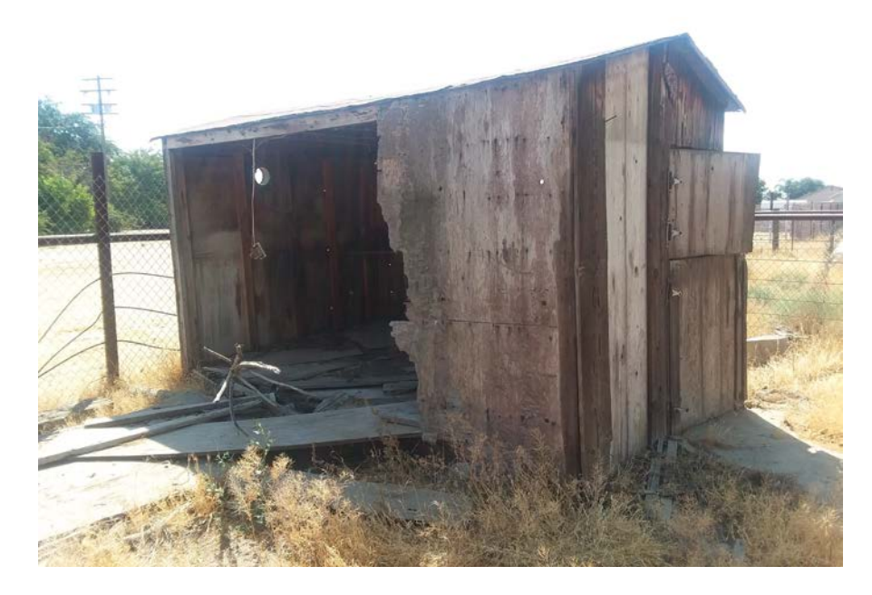
Figure 5 P-1, Building 1, View toward the Southeast