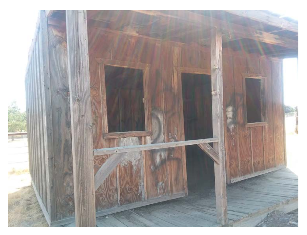
Figure 7 P-1, Building 3, View toward the East, Western Elevation

attached to the west elevation. The shed porch is raised on dimensional lumber supports. The porch deck is raised off the ground. The entire structure rests on concrete piers, which support wooden flooring. A centered entrance flanked by two window openings pierces the west, primary, elevation (see Figures 2, 3 and 7). The north, south, and east elevations are blank. The interior is again not finished, shelving is in the southeast corner (Figure 8).