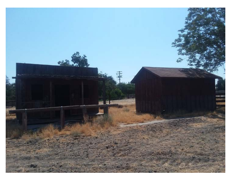
Figure 3 P-1, Buildings 2 and 3, View toward the East