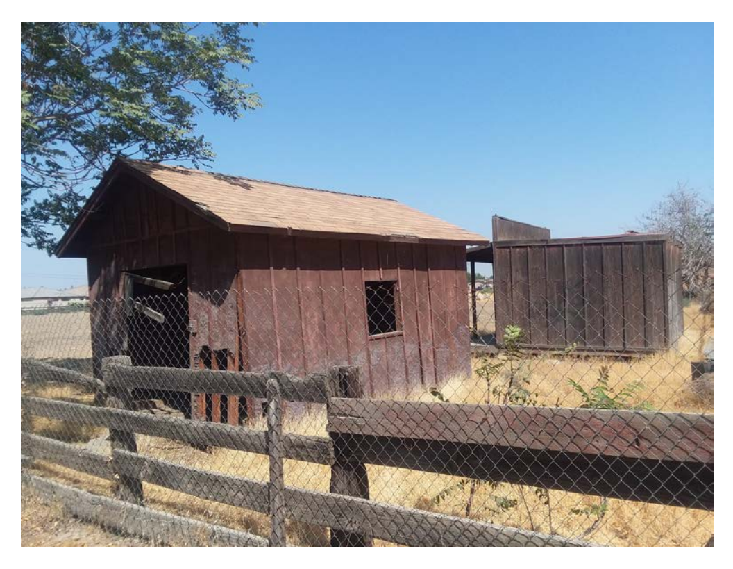
Figure 4 P-1, Buildings 2 and 3, View toward the Northwest