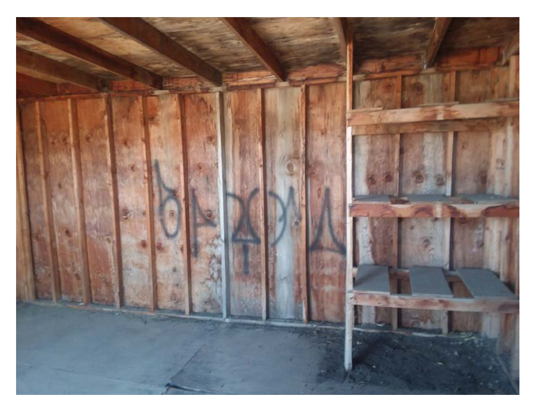
Figure 8 P-1, Building 3, View toward the East of the Building's Interior