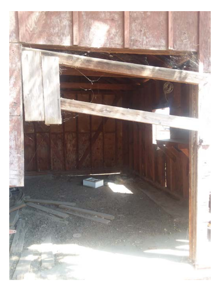
Figure 6 P-1, Building 2, View toward the North

The second building is another small, one-story, frame gable-roofed work building (see Figure 3 and 4). The primary entrance is toward the south (Figure 6). Board and batten vertical siding covers the structure. A window opening pierces the east elevation, which contains shelving. Pegboard still adheres to the west elevation. The walls are unfinished; however, the building is partially insulated. The flooring is a wooden deck, and the building rests on concrete block piers.