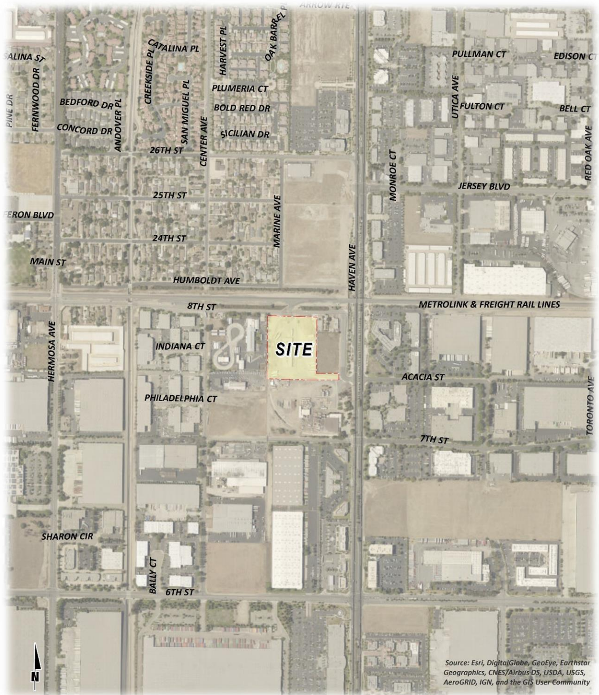
EXHIBIT 1-A: LOCATION MAP