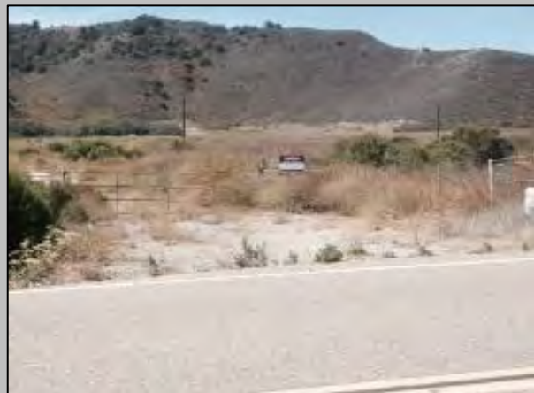
Proposed staging area on south side of San Antonio Road West.