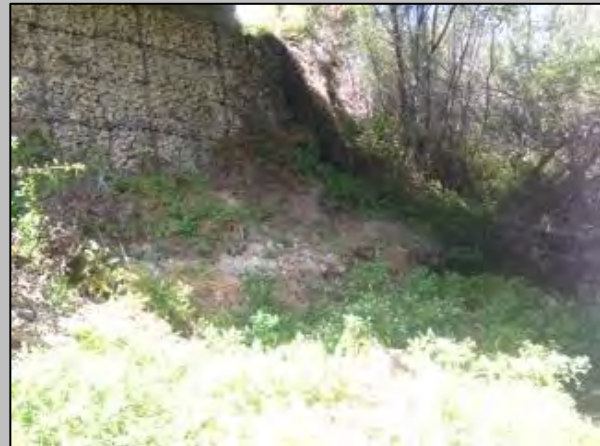
Gabion baskets on west side of bridge, showing vegetation growth.