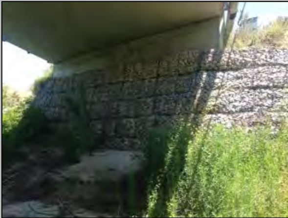
Gabion baskets on east side of bridge, showing sediment deposition.