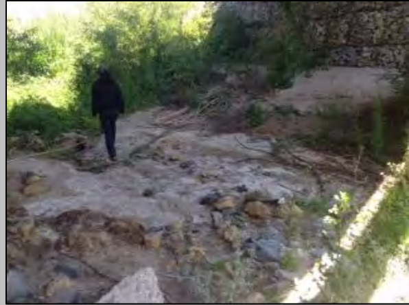
Underneath east side of bridge, showing sediment deposition.