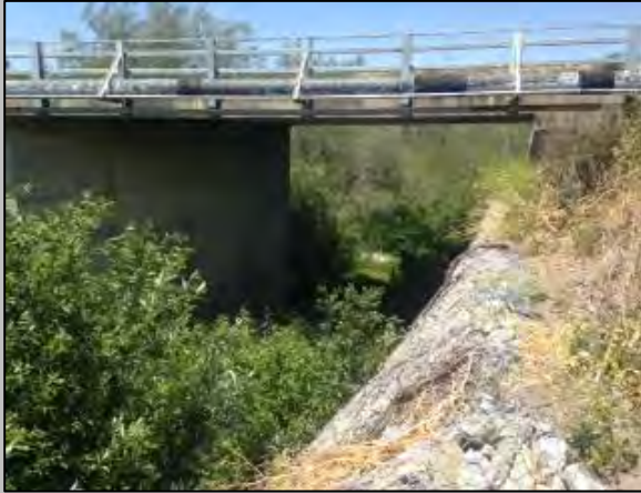
San Antonio Road West Bridge, east side.