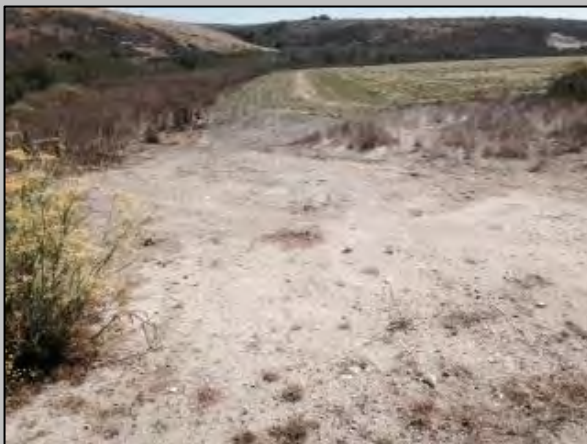
Proposed staging area on north side of San Antonio Road West.