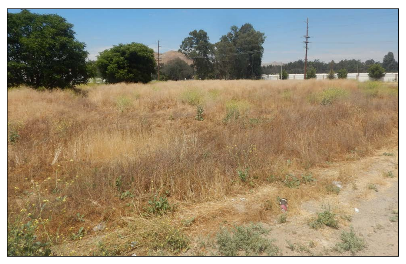
Figure 3. Onsite overgrowth