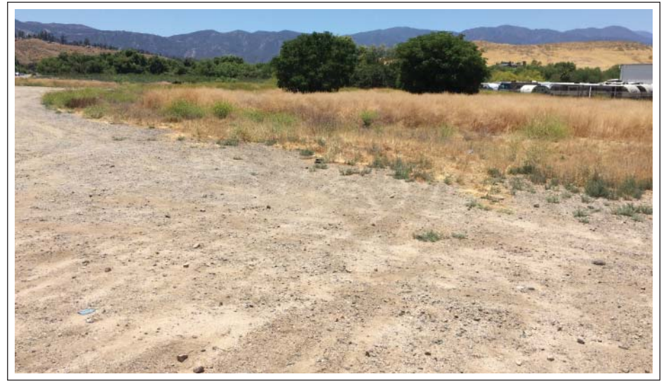
Ruderal vegetation (background) and bare ground (foreground) in the northeast corner of the survey area, facing southwest.