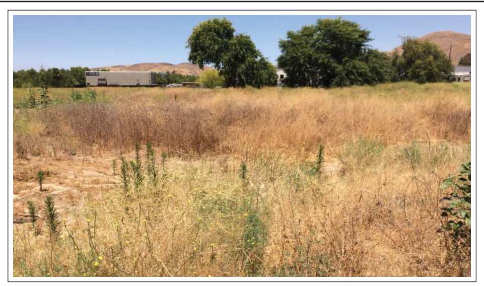
Ruderal vegetation in the southwest corner of the survey area, facing northwest.