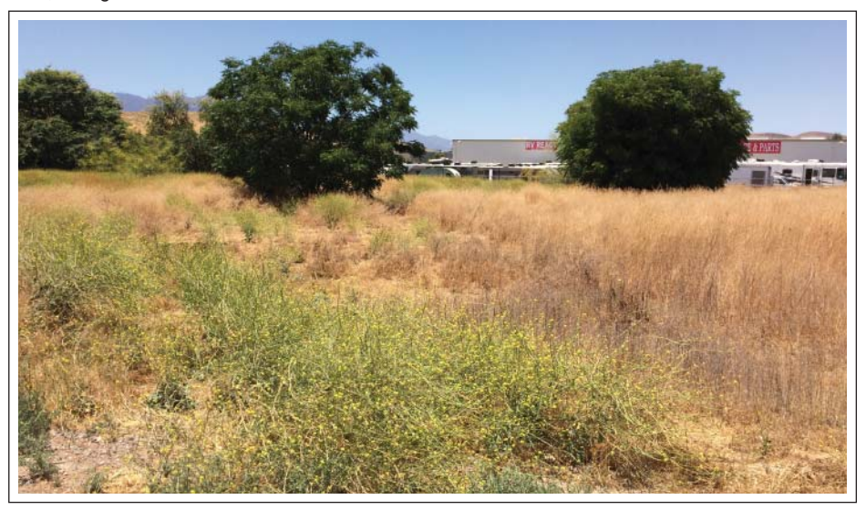
Ornamental trees in the center of the survey area.