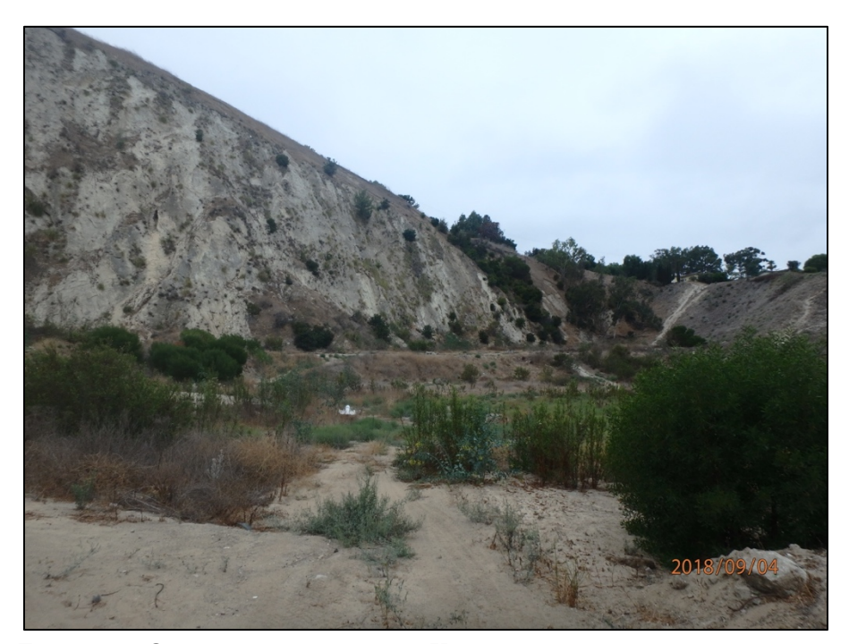
Figure 4. Overview of excavation cut. View west.