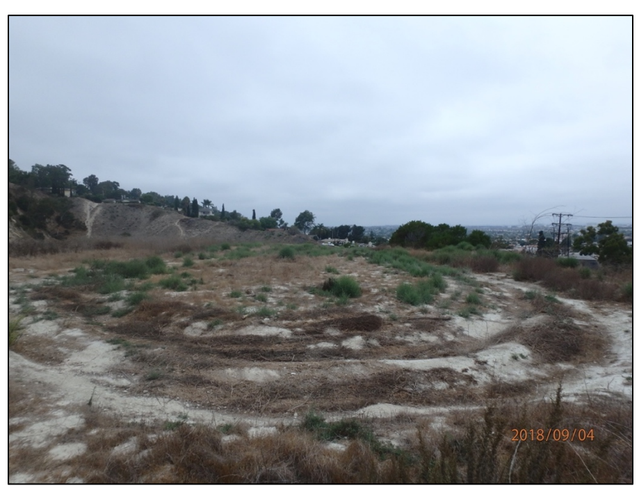
Figure 5. Project overview from northeastern portion. View west.