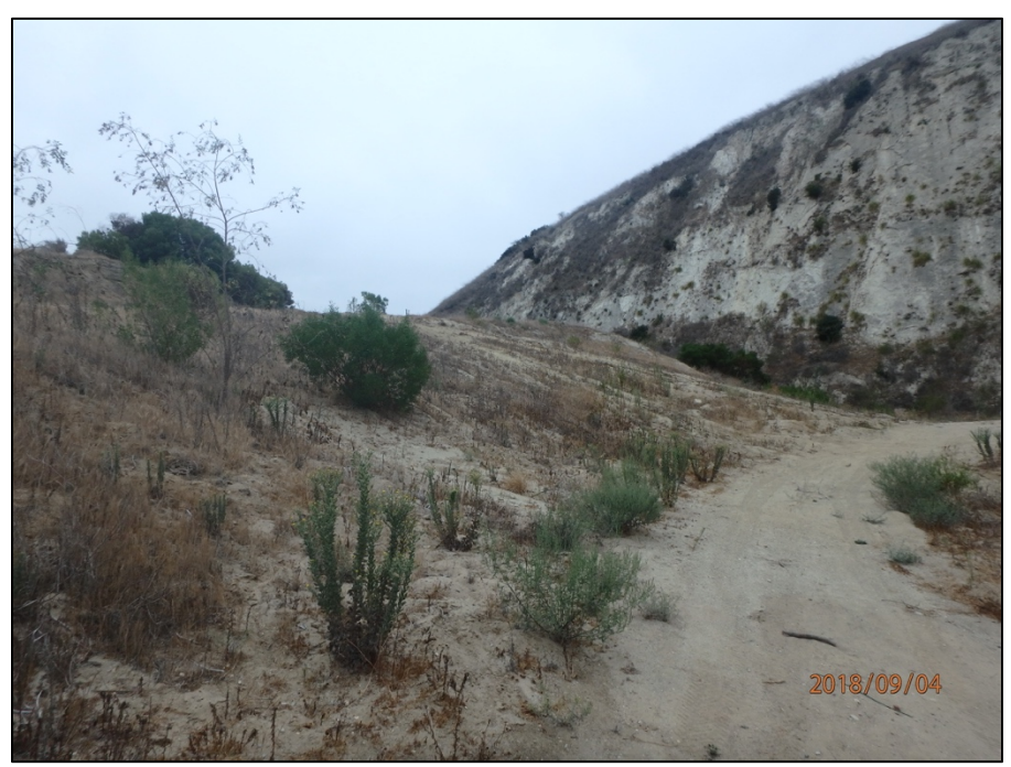
Figure 3. Overview of excavation cut. View south-southeast.