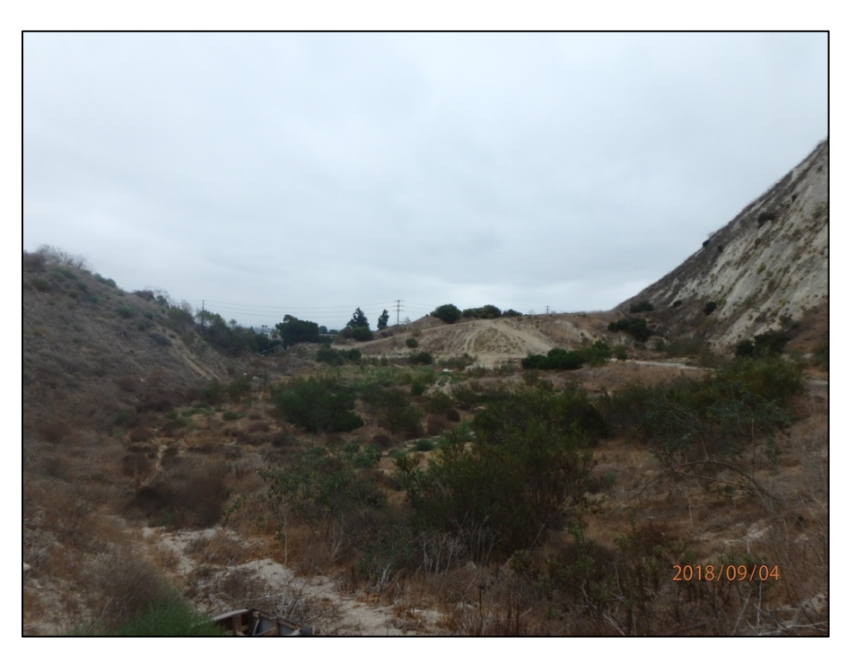
Figure 8. Project overview from western portion. View east.