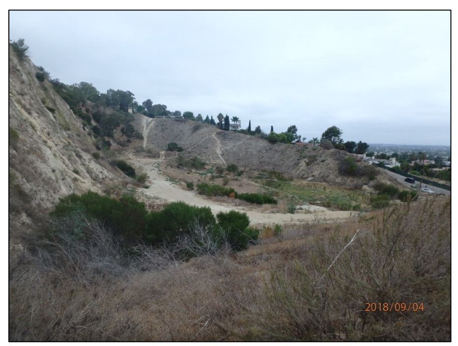
Figure 6. Project overview from southeastern portion. View west.