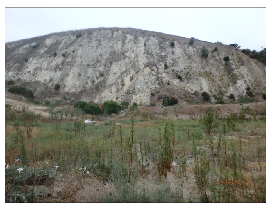
Figure 7. Project overview from northern portion. View south.