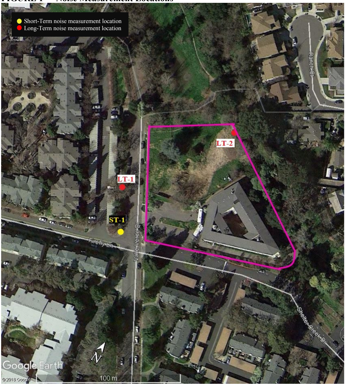
FIGURE 1 Noise Measurement Locations