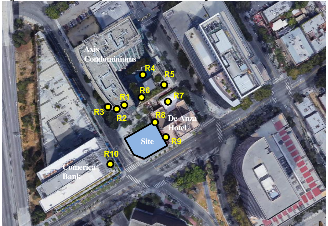
Figure 1Hotel Project Site and Modeled Receptor Locations

This memo has been prepared to describe the potential noise impacts resulting from activities occurring in the rooftop bar area proposed as part of the Almaden Corner Hotel at 270 West Santa Clara Street in San José, California. Noise sensitive uses surround the site include the adjacent (less than 5 feet) De Anza Hotel to the east, the Axis Condominium Building, approximately 60 feet to the north, and the Comerica Bank, approximately 60 feet to the west. Figure 1 shows the project site and vicinity.