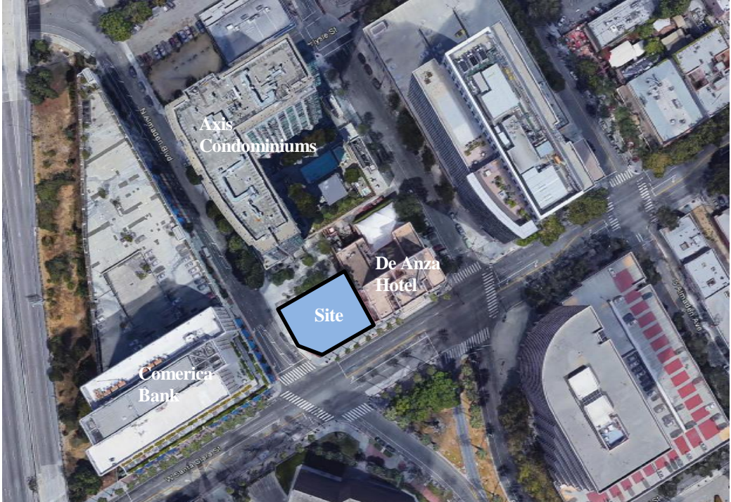
Figure 1 Hotel Project Site and Vicinity

This memo has been prepared to describe the potential noise and vibration impacts resulting from the construction of the hotel proposed at 270 West Santa Clara Street in San José, California. The project proposes to construct a nineteen-story, 216-room hotel, with two underground levels for parking, meeting rooms on the ground floor, and rooftop amenities including a bar and pool area. Figure 1 shows the project site and vicinity.